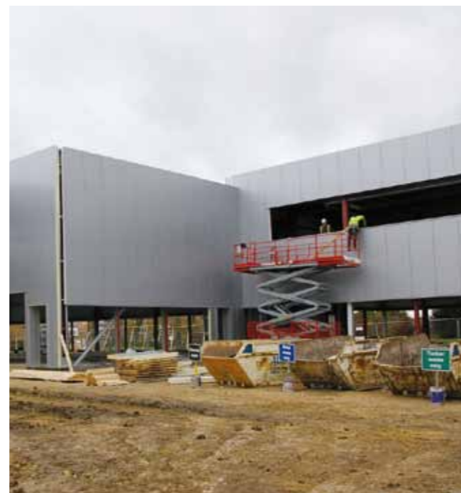
Our Netpark project

We are currently on site at Sedgefield, working on behalf of Durham County Council, on a design and build project to deliver a 1,768sq.m production and clean room facility at Netpark, one of the region's fastest growing science parks.