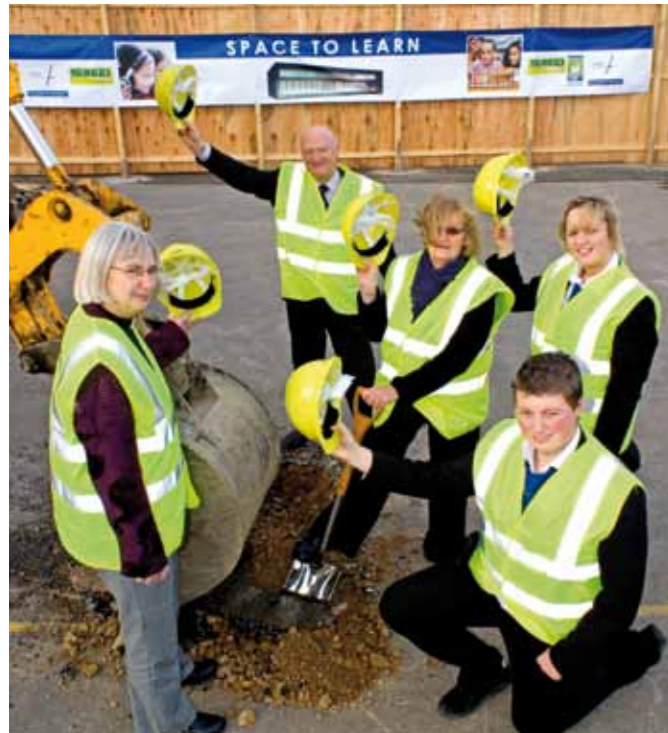
Breaking the ground in Hartlepool

The ground breaking has just taken place and work will get underway in earnest before Christmas.